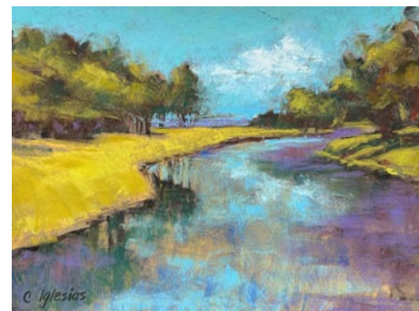
Work by Carol Iglesias

For further information check our SC Institutional Gallery listings or visit ( www.coastaldiscovery.org ).