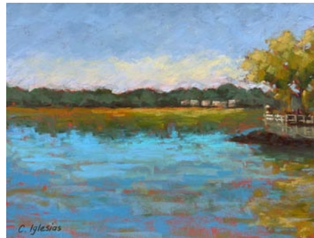
Work by Carol Iglesias

Featuring works in oil, acrylic, watercolor, pencil, mixed media, and sculpture, jewelry and garden art 56 Calhoun Street, Bluffton, South Carolina lapetitegalerie.com